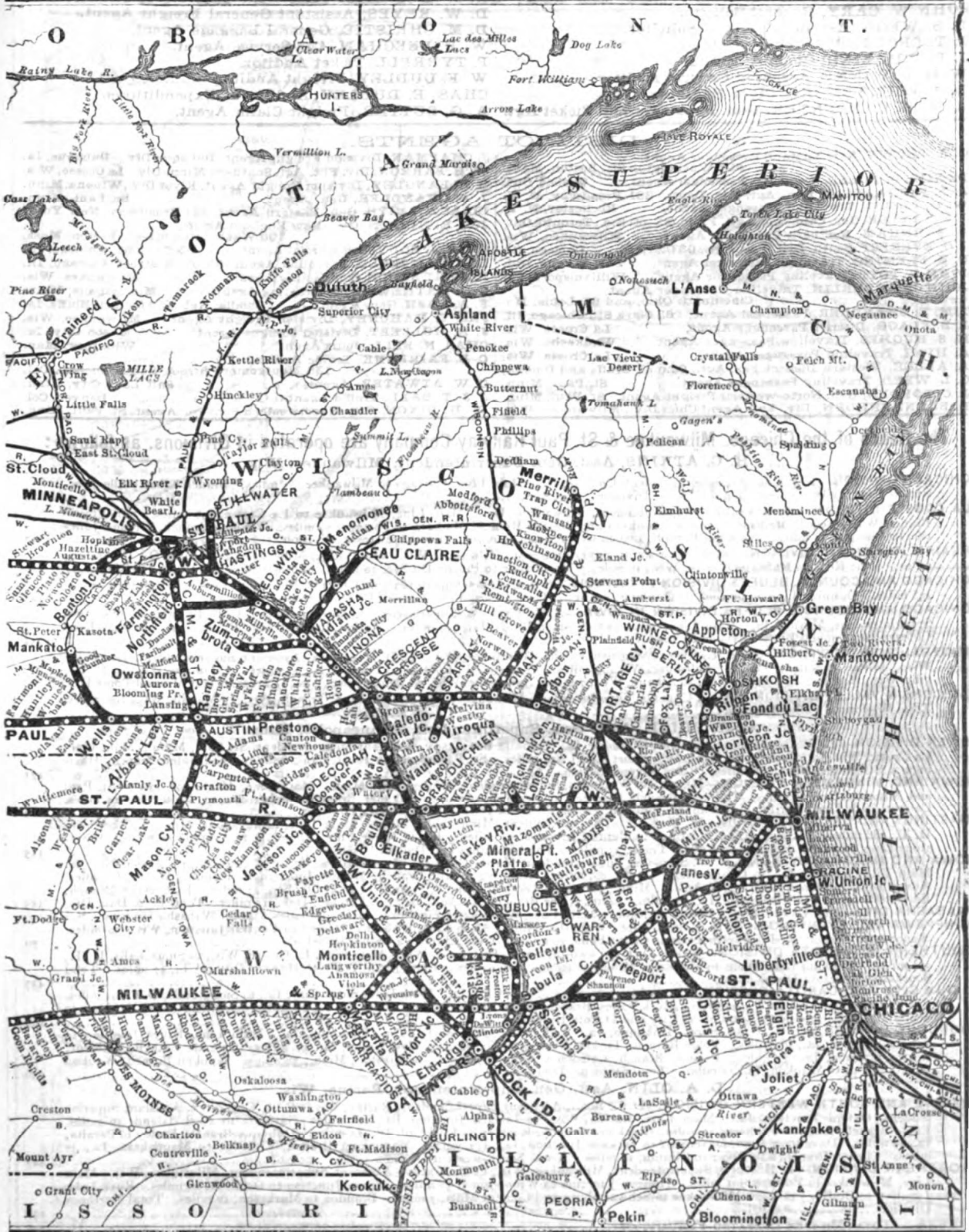
In The Union Switch & Signal Co's Automatic Rail Circuit Block Signal system the track is divided into sections, and the rails of each section so connected by wires to a battery and a signal, that the signal can only indicate safety when there is safety